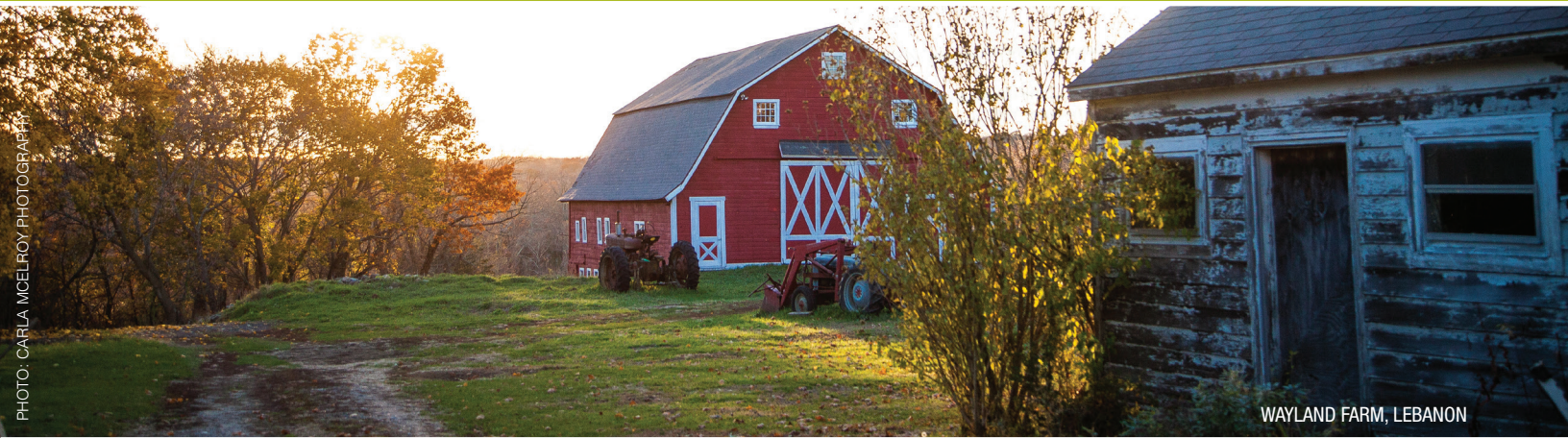
WAYLAND FARM, LEBANON