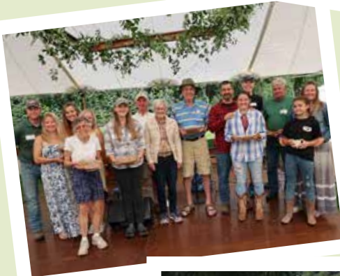
Farm families, shown holding their CFT-tradition apple crisp, who protected their land with CFT