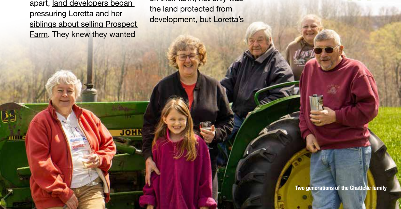
Two generations of the Chattelle family